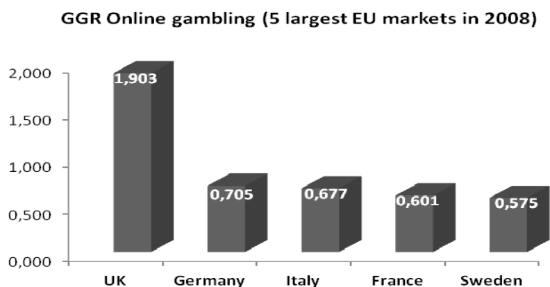
Figure 2. Five largest national on-line gambling markets in the EU in 2008 (GGR in bn €) 17

National levels of demand for these on-line services vary across the Union depending on a number of factors. In that respect it is not surprising to see that the UK is the largest market at the current time given that its e-commerce market is twice as large as the average for the Member States 16 . It is however interesting to note that some of the largest markets in 2008 were Member States characterised by the restrictive regulatory model, i.e. France, Germany, Italy and Sweden.